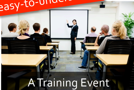
A Training Event